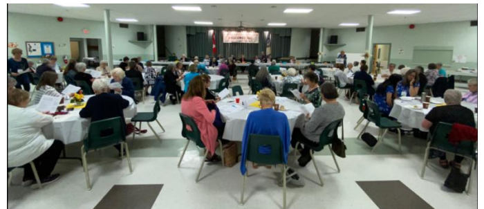
Delegates at business session.