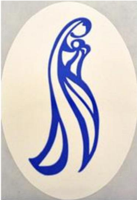
Newsletter of the Pembroke Diocesan Council of The Catholic Women's League of Canada