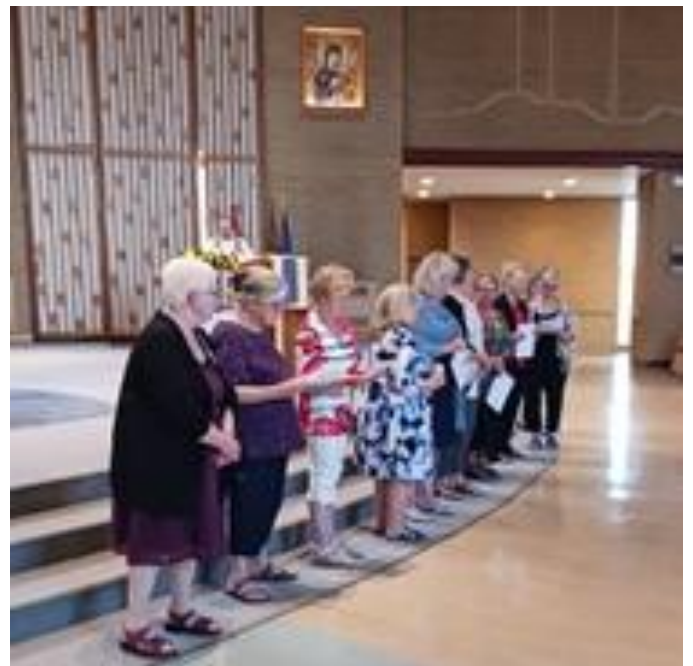
Reaffirmation Ceremony before final dismissal at Mass.